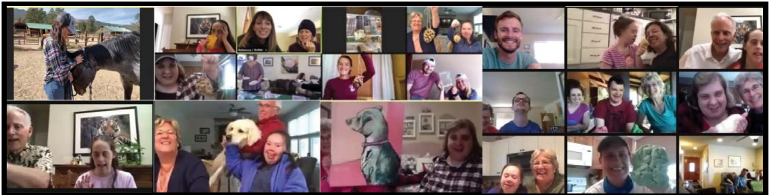
Participants at RVRN's 100 Elk Online Program