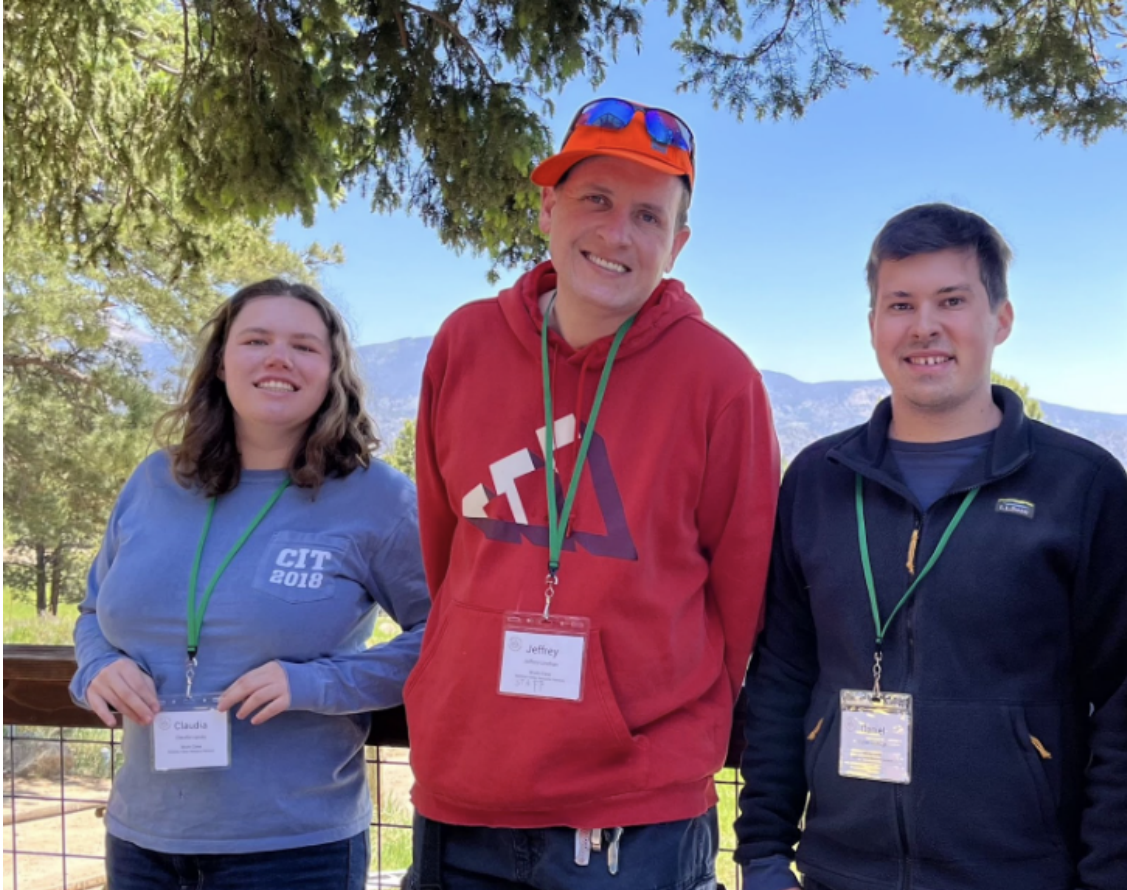
Trainees take a well-deserved break during the Work Experience Program in July.