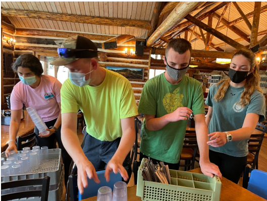
Coaches and trainees working side-by-side setting tables

We are delighted to share with you just some of the good that is going on in our community!