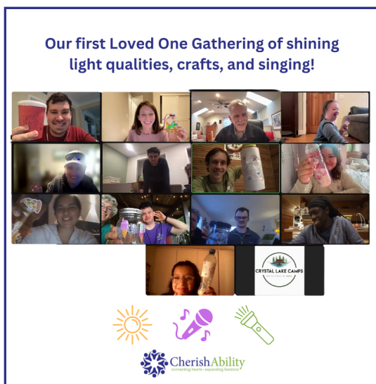
February Loved One Gathering with Crystal Lake Camps